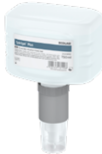
750ml Nexa Cartridge